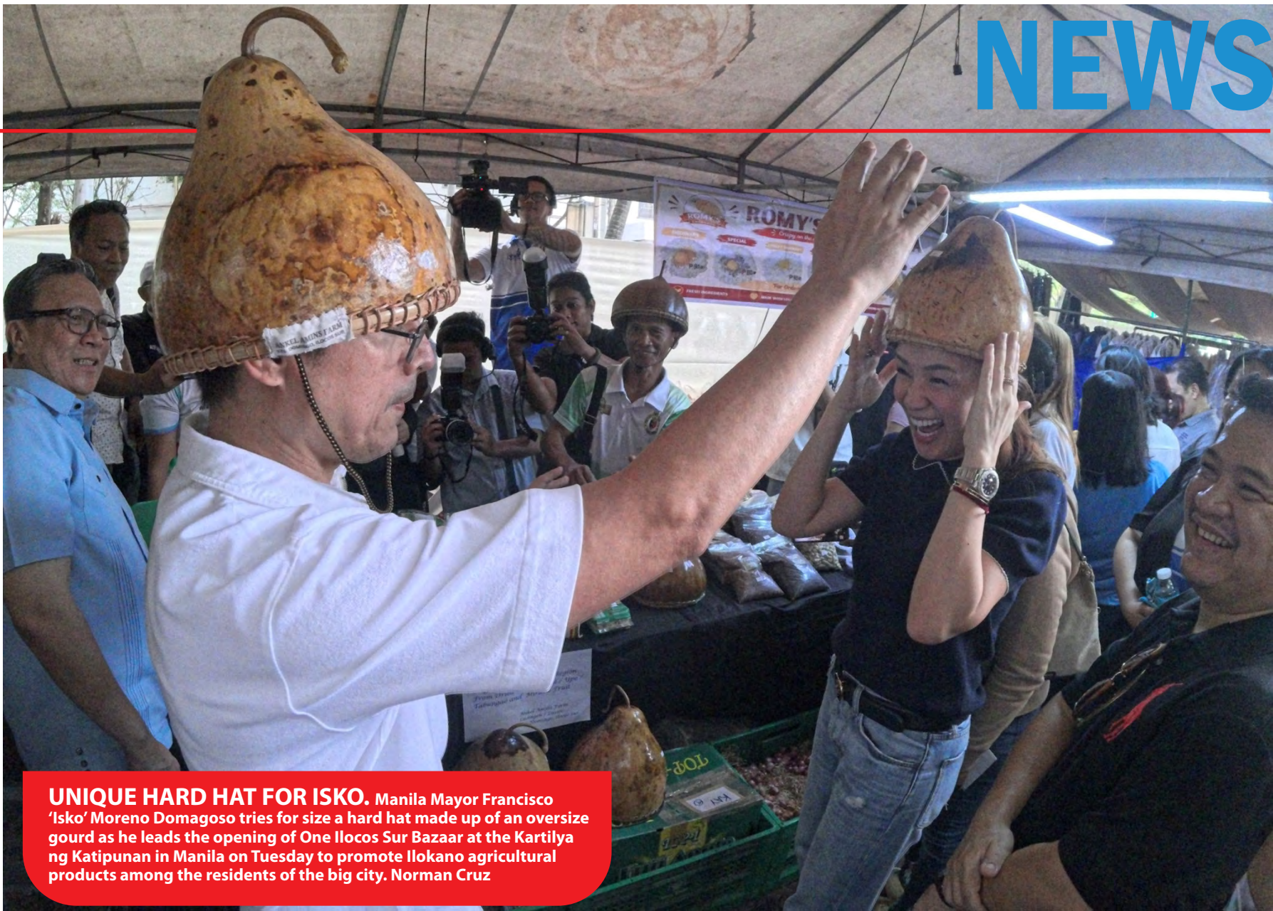
UNIQUE HARD HAT FOR ISKO. Manila Mayor Francisco ‘Isko’ Moreno Domagoso tries for size a hard hat made up of an oversize gourd as he leads the opening of One Ilocos Sur Bazaar at the Kartilya ng Katipunan in Manila on Tuesday to promote Ilokano agricultural products among the residents of the big city.