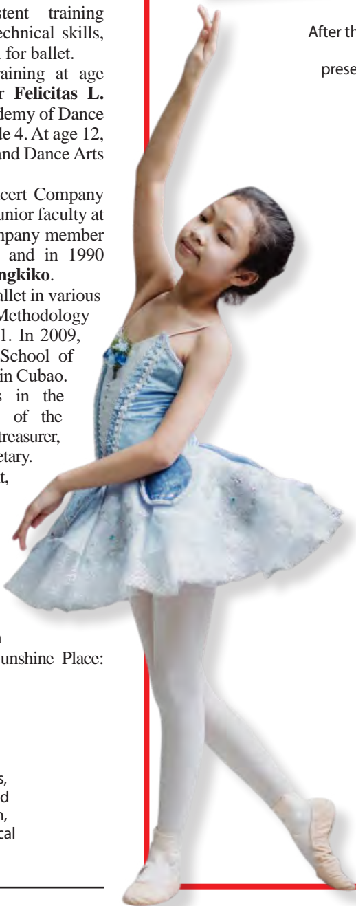
Sunshine Place offers ballet classes for children and adults, giving learners a space to build grace, discipline, coordination, and confidence through classical dance training