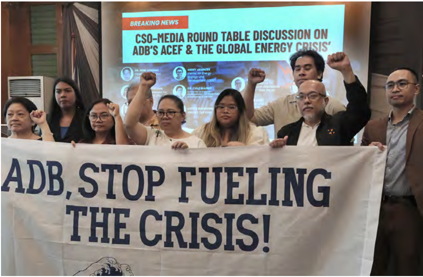
‘END FOSSIL-FUEL DEPENDENCE.’ Civil society groups and allied organizations unfurl a banner reading ‘ADB, Stop Fueling the Crisis’ during a forum and report launch in Pasig City on June 9, calling on the Asian Development Bank (ADB) to end support for fossil fuel-dependent projects and pursue a just, community-centered energy transition. Manny Palmero

Go cited Republic Act 4136, which prohibits parking that obstructs fire hydrants, pedestrian crossings, and street corners. He stressed that roads are intended for public use and should remain free of obstructions. Itchie G. Cabayan