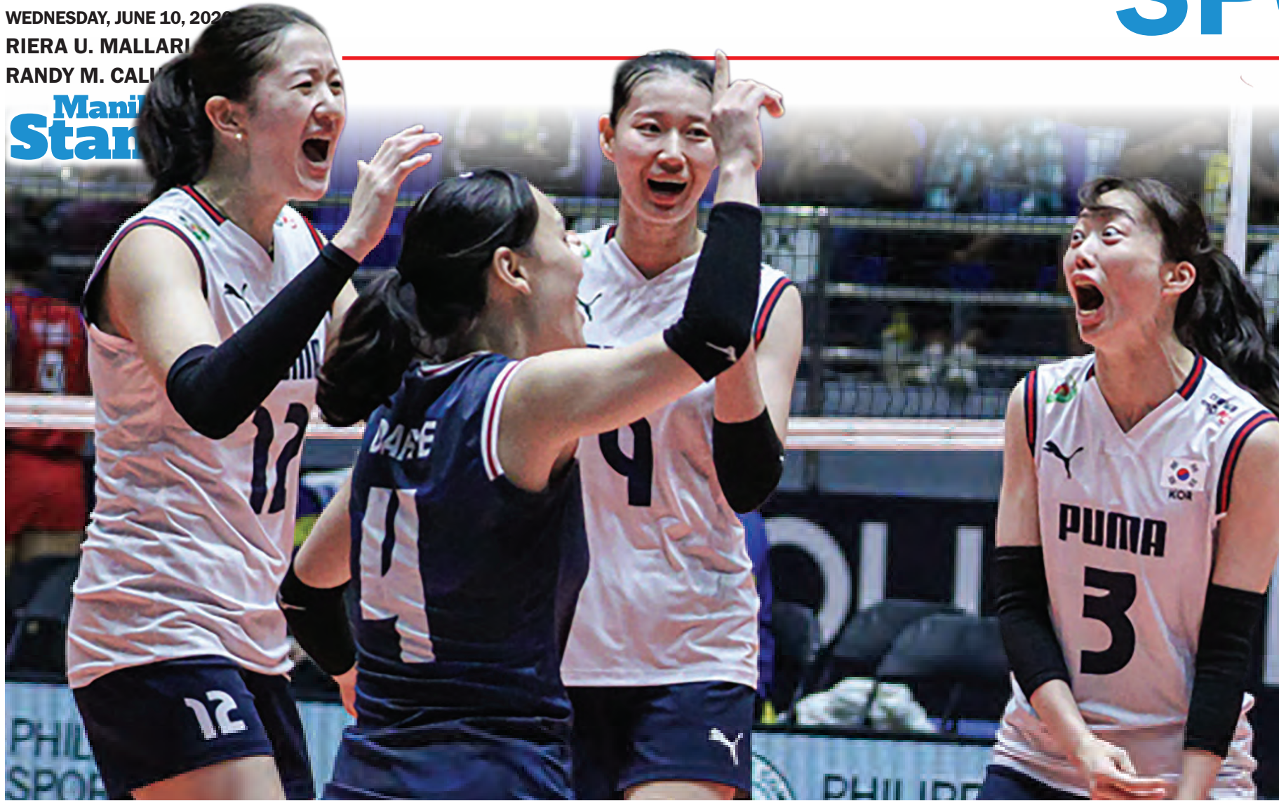
Korean players celebrate their victory over Alas Pilipinas.