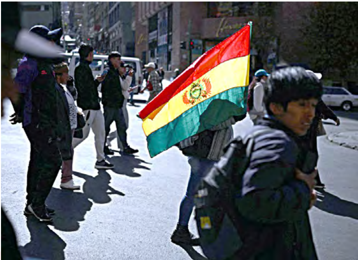
CRIPPLING PROTESTS. People with Bolivian national flag take part in a march against the blockades and for the resignation of Bolivia’s President Rodrigo Paz, in La Paz on Tuesday, Manila time. Bolivia’s legislature gave the green light on June 7, 2026 for President Rodrigo Paz to use the military to clear roadblocks that have crippled key cities for weeks.