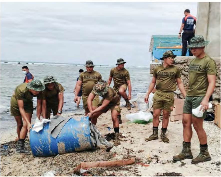
LANDING TEAM. Marines from Marine Battalion Landing Team-8 (MBLT-8) of the 4th Marine Brigade take part in a multi-agency oil spill response operation along the coastal waters of Barangay La Virgen Milagrosa in Badoc, Ilocos Norte, following the grounding of a cargo vessel off the shoreline.