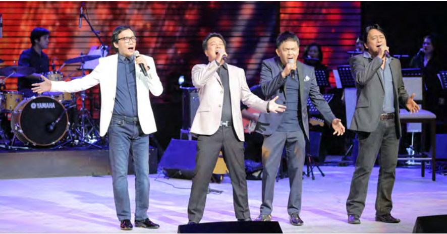
From left: Rey Valera, Hajji Alejandro, Rico J. Puno, and Marco Sison represent the artists who helped expand Manila Sound into a broader OPM tradition