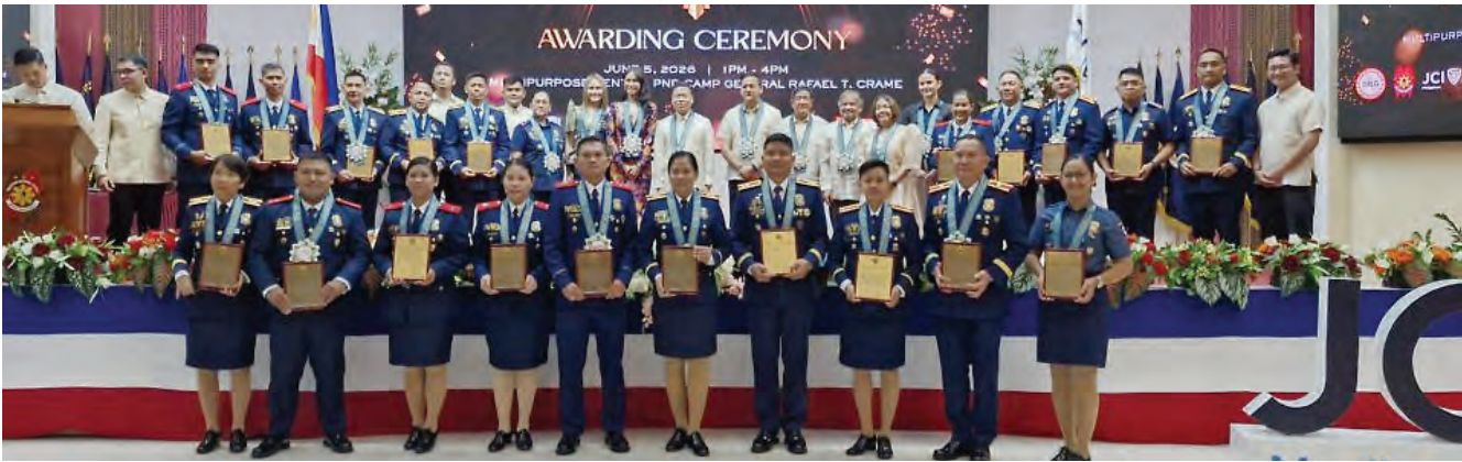
JCI MANILA CELEBRATES EXCELLENCE IN POLICE SERVICE. Awardees of the 7th Ignacio B. Jimenez Outstanding Police Service Awards proudly pose with JCI Manila officers during the ceremony at PNP Multipurpose Hall, Camp Crame. The event recognized 20 exemplary police officers for integrity, dedication, and service to communities across the Philippines.

and Filipino craftsmanship. The company’s growth also reflects the often-overlooked potential of rural entrepreneurship. While economic opportunities are frequently concentrated in urban centers, businesses operating in provincial communities create jobs closer to home, allowing families to remain together while earning a stable livelihood. Golden Arrow’s commitment to generating employment in the countryside highlights how local enterprises can contribute to community development beyond financial gains. Food, after all, is more than nourishment. For many Filipinos living far from home, familiar delicacies evoke memories of childhood, family, and tradition. A simple biscuit or wafer roll can become a connection to one’s roots, especially for those separated from their hometowns or living overseas. As the Philippines continues to navigate modernization and globalization, stories like this serve as a reminder that preserving culture does not always happen in museums or history books. Sometimes, it begins in a small town bakery, where recipes endure, traditions survive, and a taste of home continues to be shared across generations.