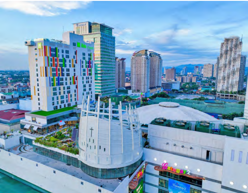
Araneta City’s June program brings Filipino food, fashion, games, arts, and culture together for the country’s 128th independence anniversary

Also on June 12, Dream Entertainment stages #TatakPinoy: