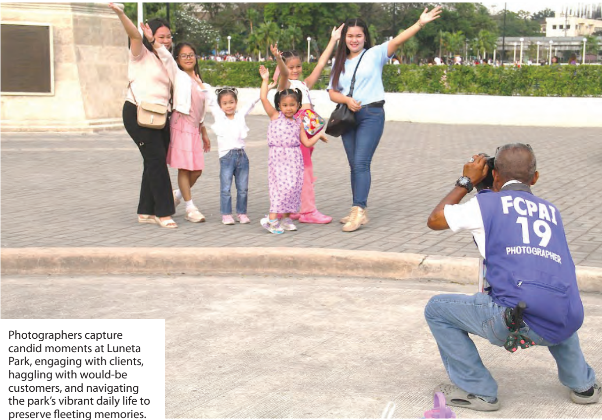
Photographers capture candid moments at Luneta Park, engaging with clients, haggling with would-be customers, and navigating the park’s vibrant daily life to preserve fleeting memories.

grassy lawns. Staying until the day is totally engulfed by sunset streaks and purple haze. And in the cool, peaceable accustomedness to the ways of the park, there’s that all-present, recognizable peer group—close-knit yet eagle-eyed, going where the crowds are, ready to eat the competition. The shutterbugs.