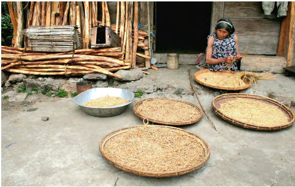
POST HARVEST PROCESS THE OLD-FASHIONED WAY. A Kankanaey woman does solar drying of freshly harvested palay in Mainit, Bontoc, Mt. Province. Dave Leprozo

Reports indicated that the African President promised to act on what he called “concerns over illegal migration” following a rise in anti-immigrant protests and sentiment in Africa’s most developed economy.