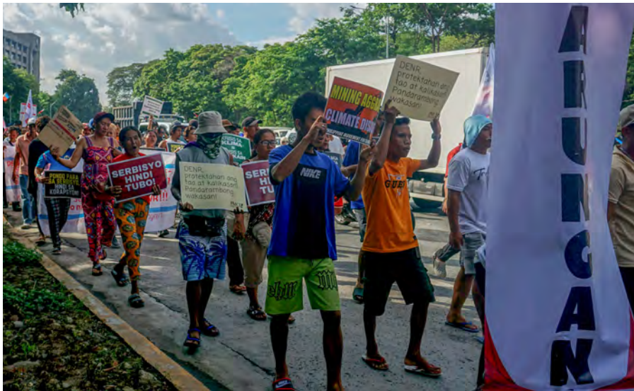
CLAMOR FOR LAND REFORM. Members of the underserved sectors in the provinces of Quezon, Occidental Mindoro, and Eastern Samar stage a protest rally in front of the Department of Environment and Natural Resources central office in Quezon City to demand the distribution of public lands to landless peasants and the immediate resolution of pending land disputes including displacement of farmers, as well as access to government services.

“Despite existing DepEd memoranda, reports have documented instances of school teachers spending personal funds for classroom repairs, facility maintenance, sanitation improvements, and other Brigada Eskwela activities in preparation for the opening of classes,” Diokno said.