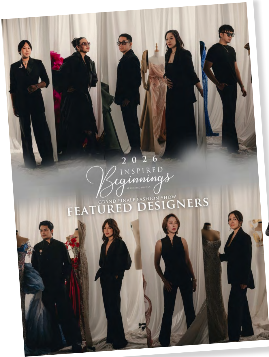
After the opening showcase, the fair continues with a broader designer lineup presenting fresh ideas for wedding fashion