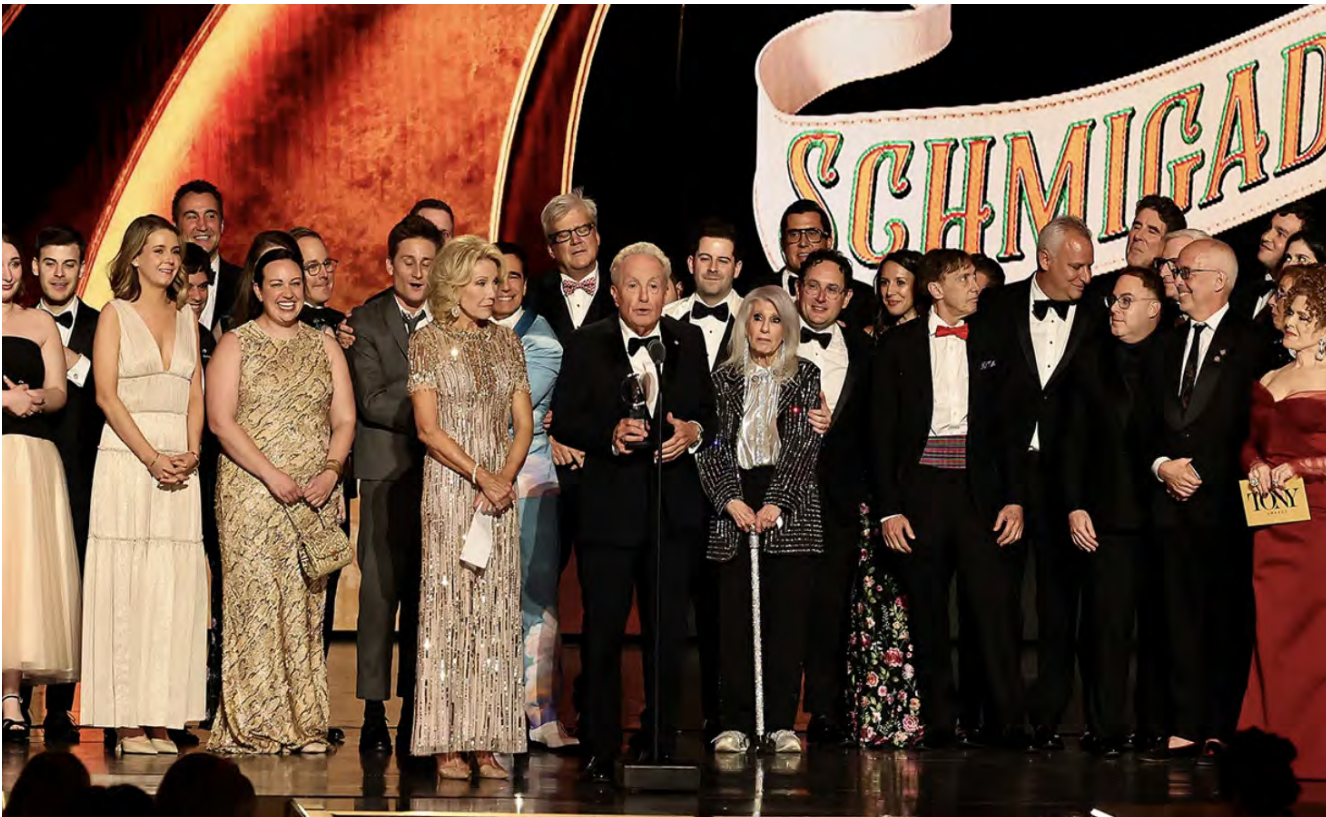
The 'Schmigadoon!' team celebrates its Best Musical win at the 79th Tony Awards