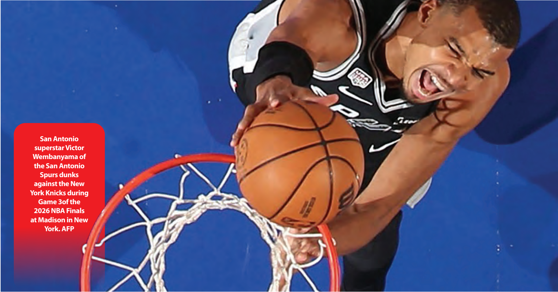
San Antonio superstar Victor Wembanyama of the San Antonio Spurs dunks against the New York Knicks during Game 3 of the 2026 NBA Finals at Madison in New York.

For the Knicks, who made 13 turnovers and were outscored 25-18 from the free throw line, a perceived lack of second-half foul calls upset coach Mike Brown.